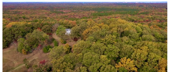
Drone Photo taken by Charles Germain, 2024

The Magothy River Land Trust is very happy to announce that an additional 240 acres of undeveloped land will soon become a part of the Magothy Greenway, thanks to a generous donation from the Looper family. This addition to the Greenway stretches from the current Greenway to waterfront on Broad Creek, as shown in the map. It consists almost entirely of woodland, plus 11 acres of coastal marsh and 3 acres of bog habitat. The house on Eagle Hill, seen in the photo, is included in the donation. We hope to use the house as a nature center.