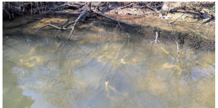
Critical Yellow Perch Egg sacks

Earth Day activities this year included several events. Seventeen employees from Vision Technologies , based in Glen Burnie, did an incredible job removing 19 bags of trash and three tires from the Yellow Perch spawning corridor, as well as six large bags of invasive plants from Lake Waterford Park.